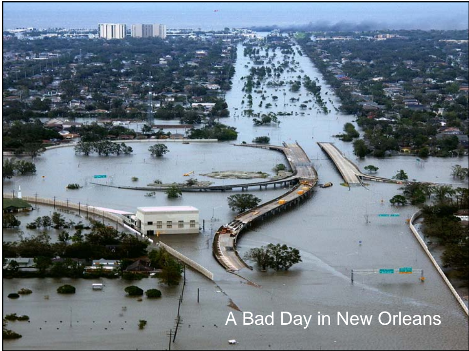
A Bad Day in New Orleans